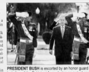
PRESIDENT BUSH is escorted by an honor guard battalion of the Pakistani Army during an arrival ceremony this morning at the Awan-e-Sadr presidential residence in Islamabad, Pakistan. Bush will spend the day today with President Pervez Musharraf.

President Bush arrived in Islamabad, Pakistan, after a 12-hour flight from the United States. He is on a state visit to Pakistan, the first by a U.S. president since the September 11 attacks. Bush is expected to meet with Pakistani Prime Minister Pervez Musharraf and other officials.