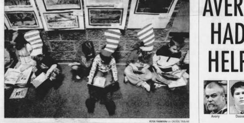
Kindergarten students wearing paper "cat in the hat" hats are paired with second graders as they take turns reading Dr. Seuss books Thursday in celebration of Read Across America at Southern Bluffs Elementary School in La Crosse.