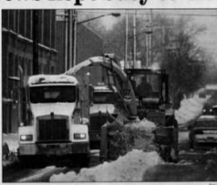
City of Manitowoc workers removed windrows Monday from street medians. Snow collected by the city is dumped in a vacant lot off Michigan Avenue, west of Evergreen Cemetery, or in a field on the north side near Albert Drive.