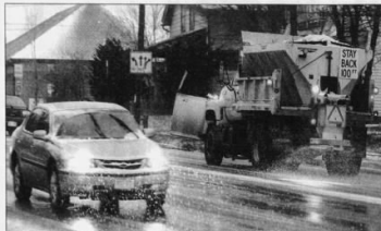
Salt trucks hit the streets in Manitowoc on Wednesday afternoon after snow and freezing temperatures combined to cause slippery driving conditions. This truck was salting Washington Street.

MANTOWOC - The Manitowoc County Aging Resource Center is scheduling one-on-one appointments to help individuals, using the computer, to narrow their Medicare prescription plan choices. People can make an appointment at the listed phone numbers below, which are all in area code 920. Please bring your Social Security card, printed prescription drug list with doses and your health insurance card. Two Rivers Senior Center, Nov. 16, 2, 30, call 793-5399 Manitowoc Senior Center, Dec. 13, 16, 22, call 683-4509 North End Drug, Manitowoc, Dec. 6, call 686-3400 North End Drug, Two Rivers, Dec. 8, call 793-5229 Nature's Nutrition Site, Dec. 7, call 775-5446 Residence Manor Apartments, Dec. 4, call 754-4101 Killbuckville Community Center, Dec. 15, call 712-3131 Kid Nutrition Site, Dec. 20, call 684-7861 Mishicot Nutrition Site, Venetia, Dec. 20, call 755-1416