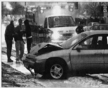
A Manitowoc police officer takes down information at the scene of a one-car accident late Wednesday afternoon along Calumet Avenue. The driver lost control on icy roads and ran into the ATM machine at Wells Fargo Bank. Blowing snow and freezing temperatures caused many accidents across the county.